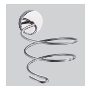
COMET-S Bracket Metal wall bracket. [Accessory not included.]

Ultra-fast and lightweight professional hair dryer. Combine three power drying speeds with two speeds of operation. Removable concentrator nozzle included and cool shot for being able to shape different hair styles.