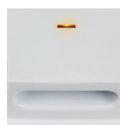
Pilot light. Carrying handle