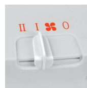
Power selection control